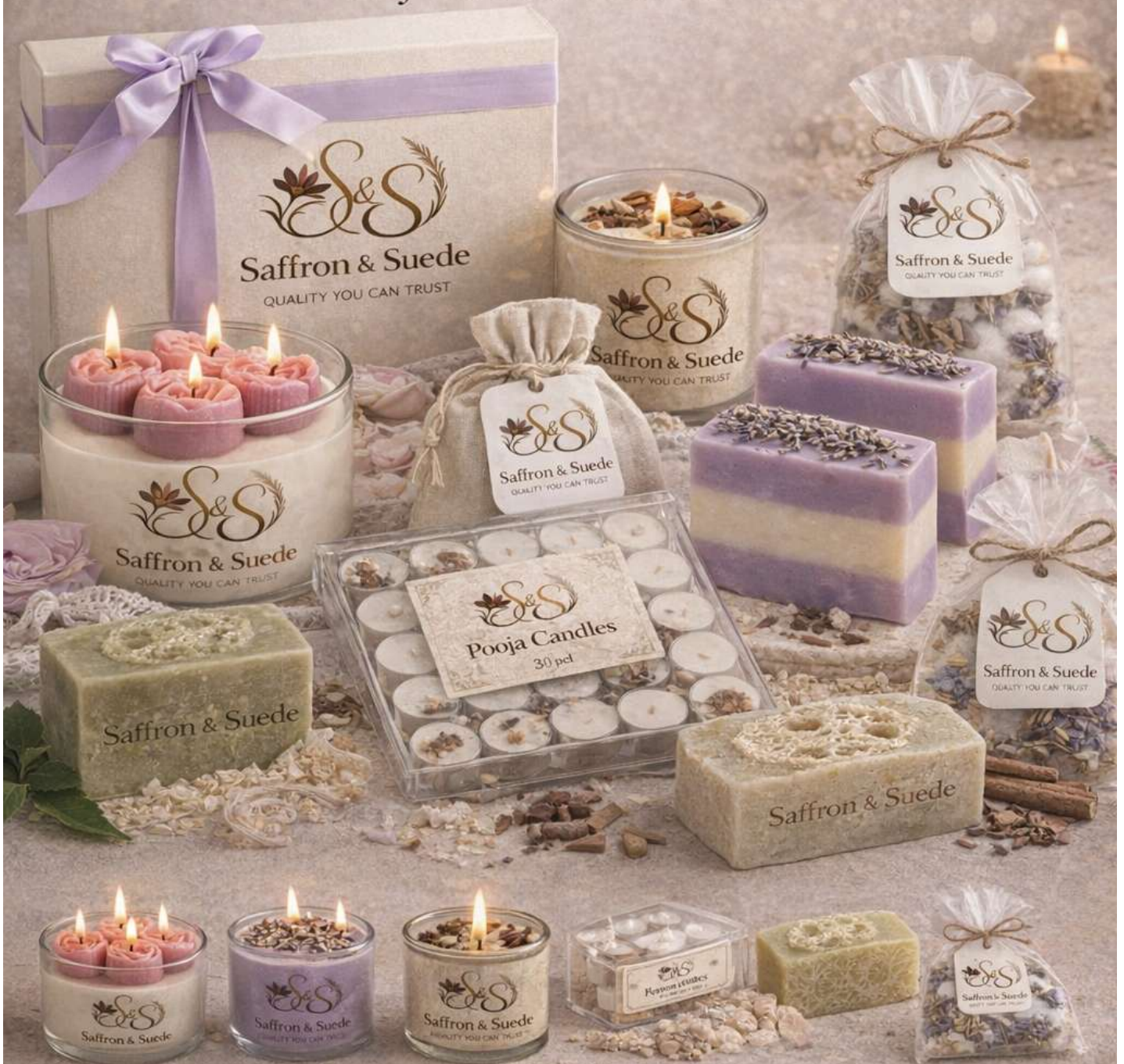
Rose Candle Lavender Candle Sandalwood Pooja Candles Neem Soap Wax Sachet Candle

Natural & Premium Handmade Self-Care Products