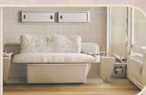
Bathroom & Living Room